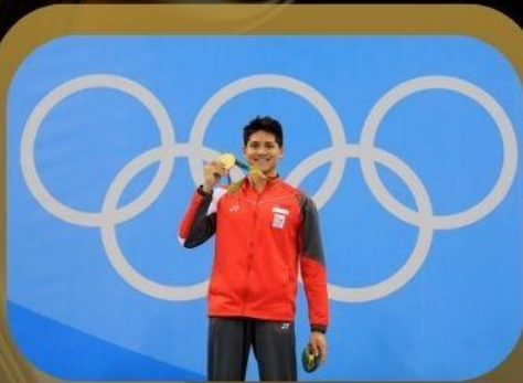
1ST OLYMPIC CHAMPION IN 2016 – JOSEPH SCHOOLING

THE NEXT Wave GALA DINNER & FUNDRAISING NIGHT 2026